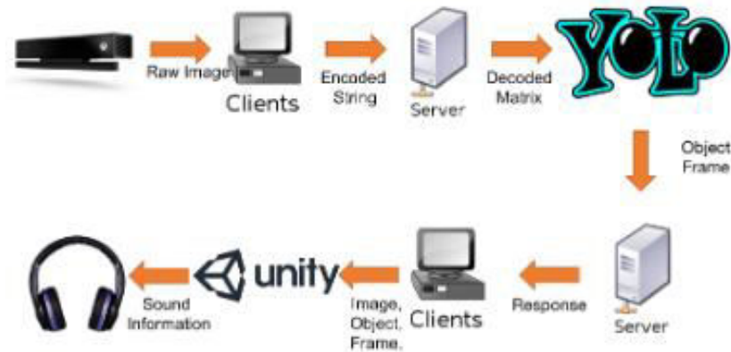
Figure 2: Data Flow Pipeline for visually impaired[Rui (Forest) Jiang Earth Science, Stanford, Qian Lin Applied Physics, Stanford Let Blind People See: Real-Time Visual Recognition with Results Converted to 3D Audio]